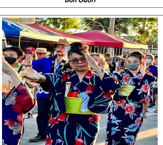
Lots of people having fun at the Buddhist Church!