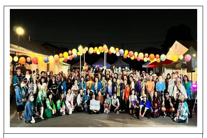
Large group in attendance for the Buddhist Church Bon Odori