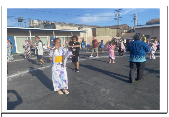
Cultural Center's Ondo Event Big Success!